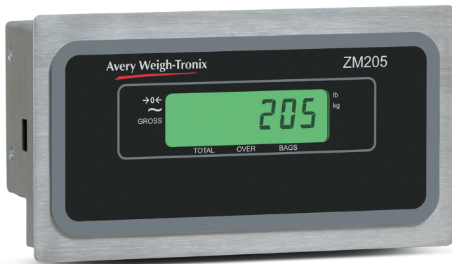
ZM205 Passenger Display