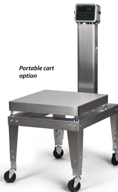
Portable cart option

Avery Weigh-Tronix - UK Foundry Lane, Smethwick, West Midlands B66 2LP UK info@awtxglobal.com Phone: +44 (0) 8453 66 77 88 Fax: +44 (0) 121 224 8183