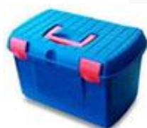
Fitted with storage case

Mobile Weighing price list MAY 2007 Category M07 ver 1.0