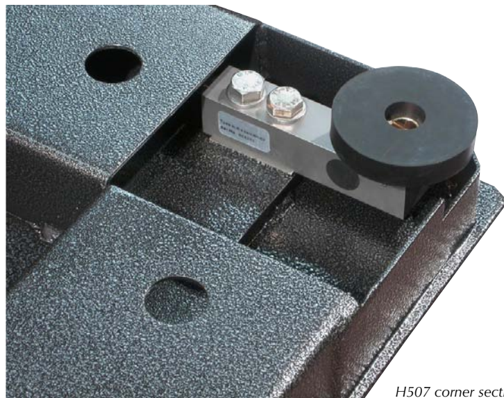
H507 corner section

© Avery Weigh-Tronix 2004. All rights reserved. This publication is issued to provide outline information only which, unless agreed by Avery Weigh-Tronix in writing, may not be regarded as a representation relating to the products or services concerned. Avery Weigh-Tronix reserves the right to alter without notice the specification, design, price or conditions of supply of any product or service.