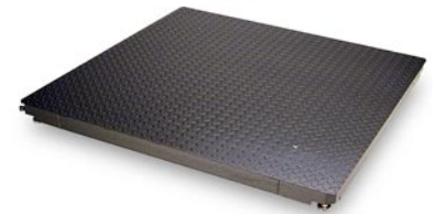
H305 and H520 remote bases.